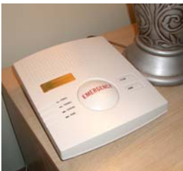
Personal Alert Controller (PAC)